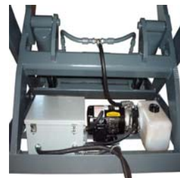
Onboard power packs & motor controls

Contact your nearest Dealer or Aerdon Equipment for Engineering & Pricing information