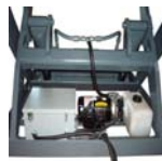
Onboard power packs and motor controls single & 3 phase

Contact your nearest Dealer or Aerdon Equipment for Engineering & Pricing information