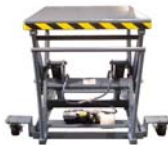
Portable options casters flanged typed, “V” groove powered wheels Steer able drives