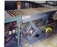
Conveyor platforms Manual gravity roller Transfer balls Powered rollers