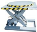
Rotating platforms Manual & Powered

Options: Higher capacities, Oversized platforms & bases, Higher lift heights, Tapered or Electric toe guards, Conveyor platforms, Rotating platforms, ( Manual or Powered ) Tilt platforms, Portability ( casters, wheels, air bearings ) 1 - 3 hp, 220-575/3/60, 12 - 24v DC, 1 - 4 hp air motors, Wash down, Explosion proof, Foot pedal controls, Automated operation, Accordion curtain enclosures, Custom finishes ( paint or galvanize ) Stainless steel platforms, Custom designed & built to Customers Specifications