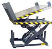
Hydraulic tilt platforms 0 - 45 degrees ( standard ) 0 - 90 degrees ( custom )