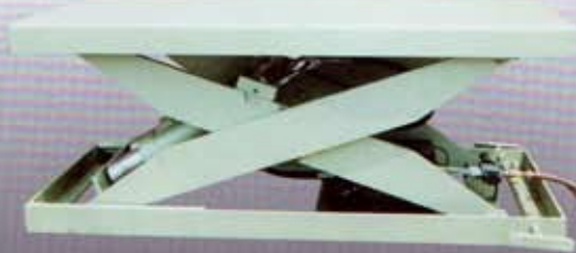
SSL Standard Scissor Lift Series 2,000 to 10,000 lbs. capacities 24"x 48" to 60"x 108" platform sizes