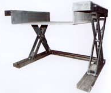
GLSL Ground Level Scissor Lift 2,000 to 4,000 lbs. capacities 40"x 48" to 48"x 48" platform sizes