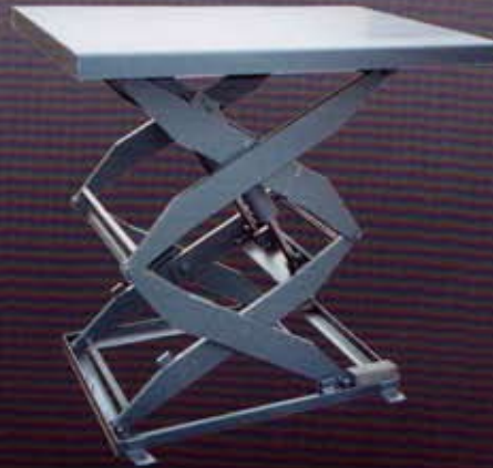
DSL Double Scissor Lift Series 2,000 to 6,000 lbs. capacities 30"x 42" to 60"x 108" platform sizes