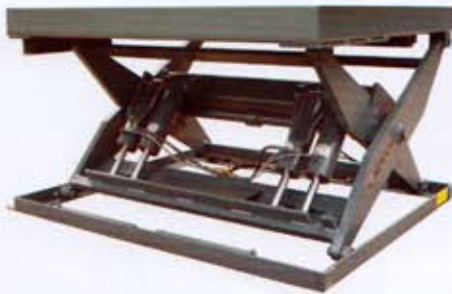
SLS Super Lift Series 12,000 to 25,000 lbs. capacities 72"x 96" to 96"x 144" platform sizes