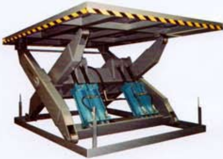
MSLS Mega-Super Lift Series 25,000 to 100,000 lbs. capacities 72"x 96" to 96"x 240" platform sizes

We focus on providing economical & durable equipment, to reduce worker injury / fatigue, and improve efficiency & productivity.