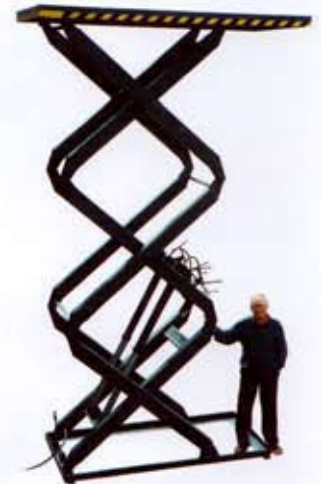
TSL Triple Scissor Lift Series 2,000 to 6,000 lbs. capacities 30"x 42" to 60"x 108" platform sizes