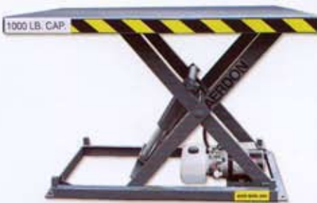
SLL Scissor Lite Lift Series Economical, Compact & Versatile 1,000 lbs. capacity 24" x 48" platform, 110 v power